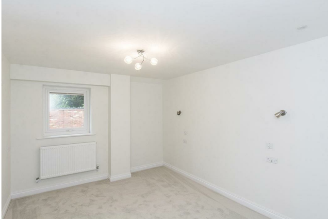
Bedroom One 14'11" x 10'7" (4.55m x 3.23m )

Double-glazed window to the front elevation. Television point. Two wall lights. Inset ceiling down lighters. Radiator. Door to en-suite shower room.