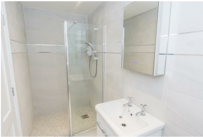
En-Suite Shower Room

Double shower cubicle with electric shower fitment. Wash hand basin with vanity unit below. Low level wc. Complimentary tiling. Heated towel rail. Opaque double-glazed window. Mirrored vanity unit with lights, anti-steam heating and speakers which link to Bluetooth. This also includes a shaver point inside.