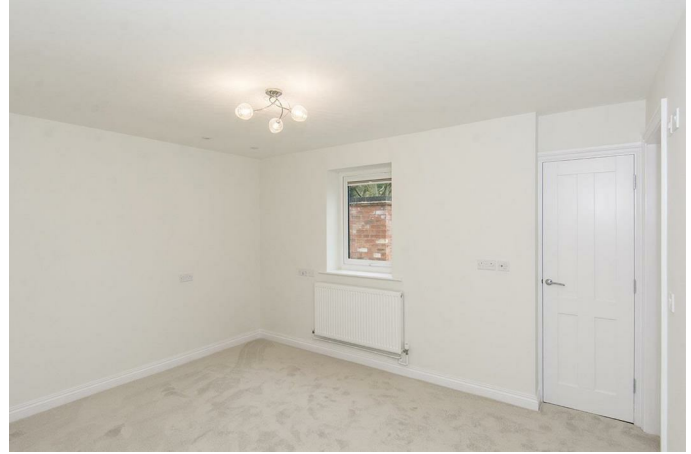
Bedroom Two 13'1" x 10'7" (3.99m x 3.23m)

Double-glazed window to the rear elevation. Radiator. Two wall lights. Television point. Built in wardrobe. Door to en-suite bathroom.